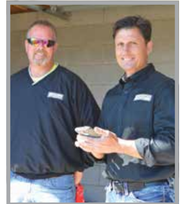
Carnahan White Fence, LLC