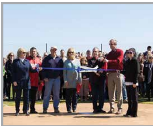
Chamber of Commerce, NCA administrators and board, Carnahan White Fence and Federal Protection cut the ribbon.