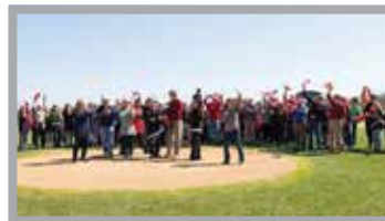
Moment of celebration-board, administration and board members