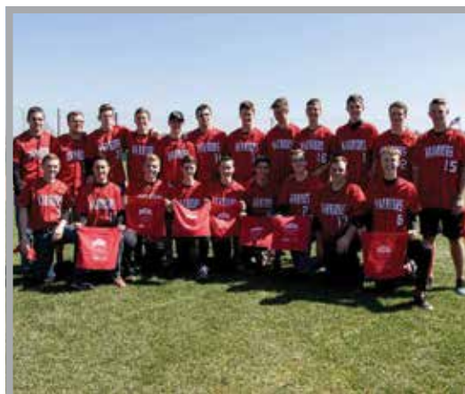
2016 Warrior Baseball team