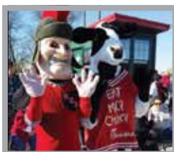
Joshua, NCA mascot and Chic-Fil-A cow