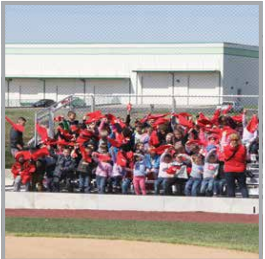
NCA students cheer wildly as the first pitch is thrown.