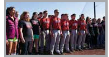
NCA Choir opens with Star Spangled Banner.