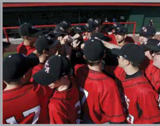
Team Circle