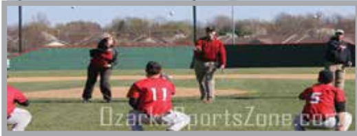
The first pitch