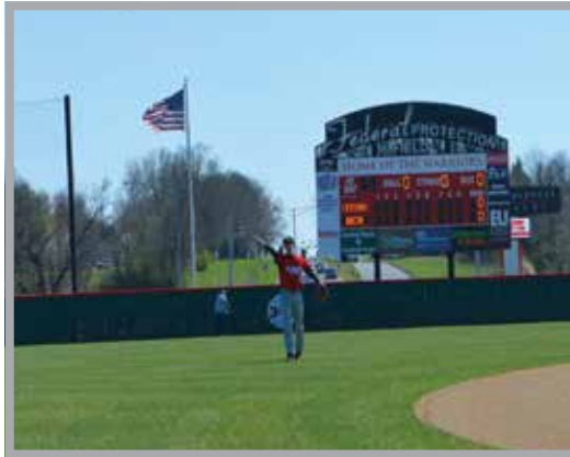
Federal Protection Field, home of the Warriors